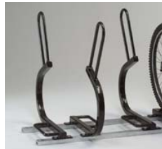
Madrax Sentry Rack