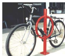
Dero Bike Hitch