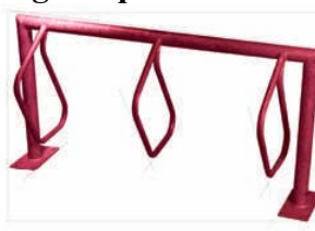
Dero Campus Rack