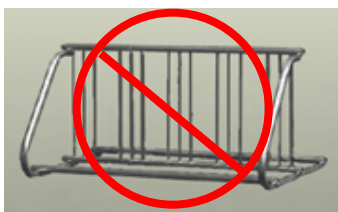
Grid or Fence Style Racks