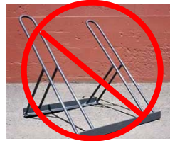
Racks that hold the bike by the wheel with no way to lock the frame and wheel to the rack with a U-lock