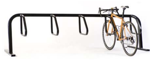
Saris City Rack