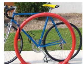
Inverted-U Type Racks