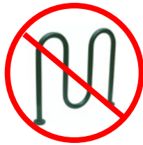
Wave or Ribbon Style racks