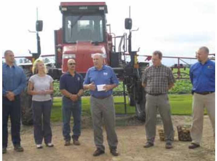
Governor Doyle on the Antigo Flats