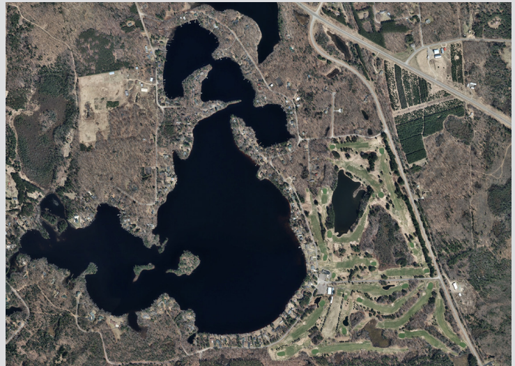
The image above is a 2015 aerial photo over Langlade County.

Every five years the Wisconsin Regional Orthophotography Consortium (WROC), coordinated by the NCWRPC, sponsors a multi-county airphoto imagery effort. This project includes partnerships with many local, federal, state, and private entities.